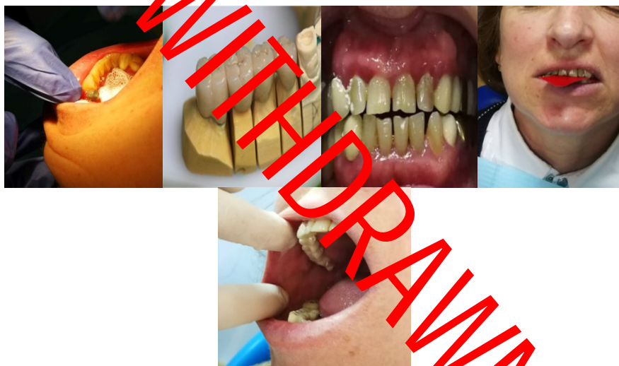
Figure 4. Adaptation and finale images of rehabilitation treatment.